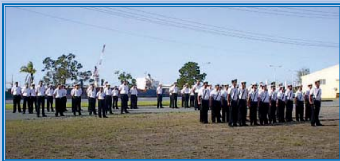
Parade formed for the Passing Out on Promotion and the Handover of SOANC QLD