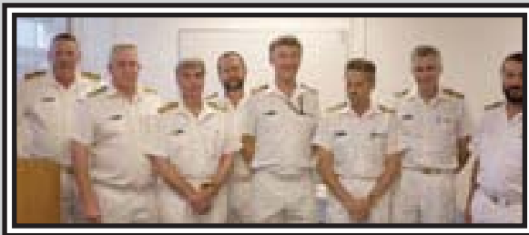
The ANC Senior Management Team