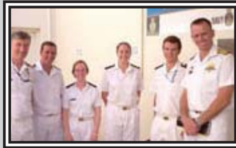
ANC MIDN attended the Conference and met with CDRE Tripovich