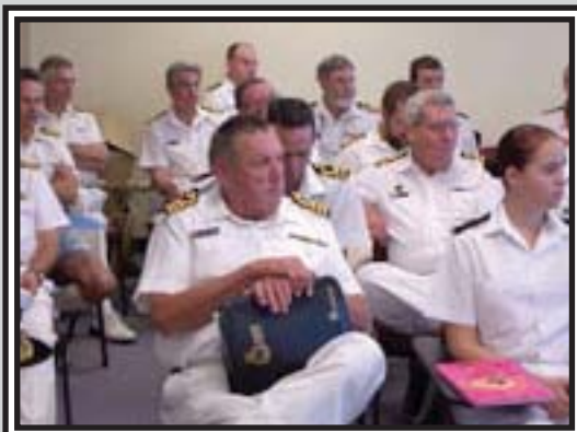
↑Other Attendees listen to key personnel presentations→